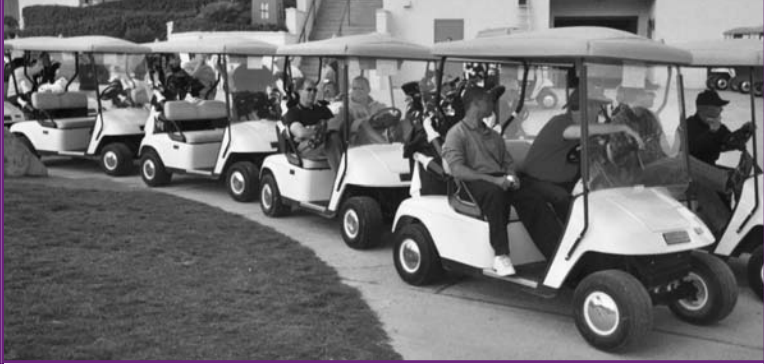
The morning line-up at the 2005 Birdies for Safe Nest Golf Tournament.